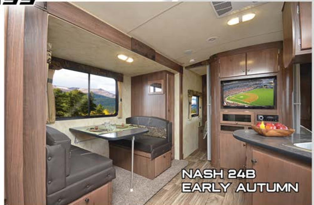
NASH 24B EARLY AUTUMN