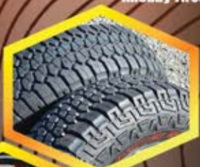
Off-Road Knobby Tires