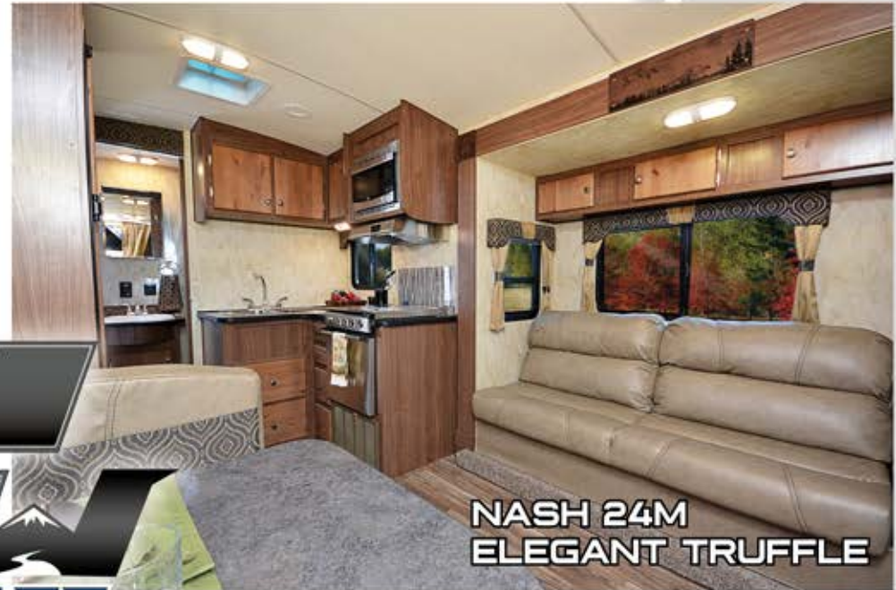
NASH 24M ELEGANT TRUFFLE