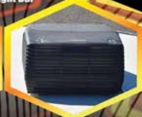
Coleman Mach Power Saver A/C