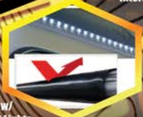
12 Volt Awning w/ FLXguard & RGB LED Lights