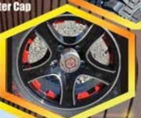
Custom Rims w/ OTG Center Cap