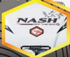
Custom OTG Graphics