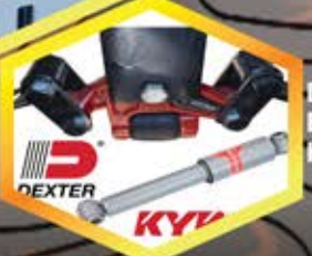
Dexter E-Z Flex Equalizers and KYB Shocks