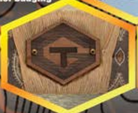
Custom OTG Interior Badging