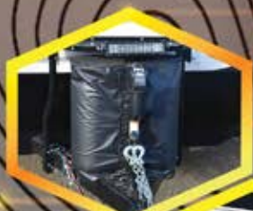
10 Gallon LP Tanks