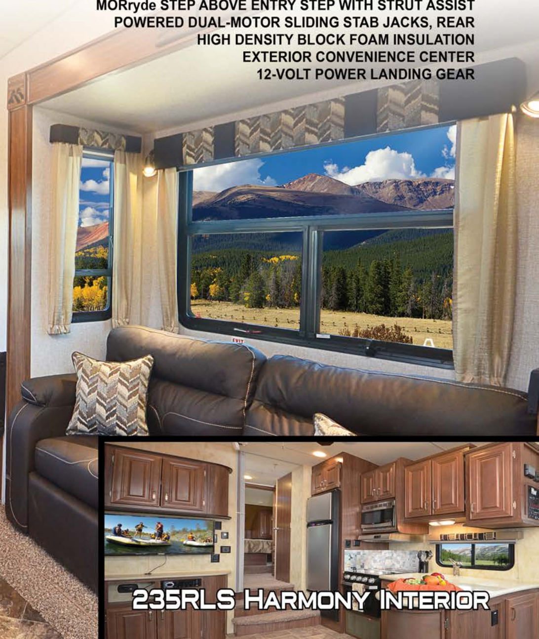
235RLS HARMONY INTERIOR