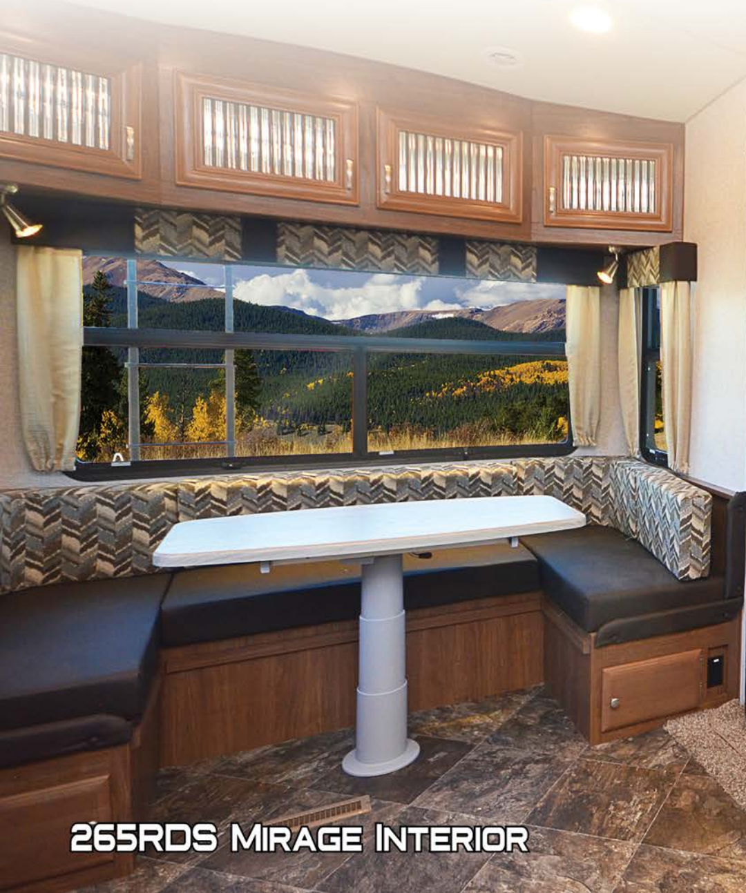
265RDS MIRAGE INTERIOR

NORTHWOOD BUILT, INDEPENDENTLY CERTIFIED, OFF-ROAD CHASSIS GENERATOR READY * CATHEDRAL ARCHED CEILING CONSTRUCTION LED EXTERIOR & INTERIOR LIGHTING * STAINLESS STEEL APPLIANCES FULLY WELDED, THICK-WALL ALUMINUM FRAME CONSTRUCTION SOLID SURFACE COUNTERTOPS * INTERIOR COMMAND CENTER ADJUSTABLE PITCH CAREFREE TRAVEL'R 12V LED AWNING FRAMELESS WINDOWS * 10 CU FT FRIDGE W/ COLD WEATHER KIT MORryde STEP ABOVE ENTRY STEP WITH STRUT ASSIST POWERED DUAL-MOTOR SLIDING STAB JACKS, REAR HIGH DENSITY BLOCK FOAM INSULATION EXTERIOR CONVENIENCE CENTER 12-VOLT POWER LANDING GEAR