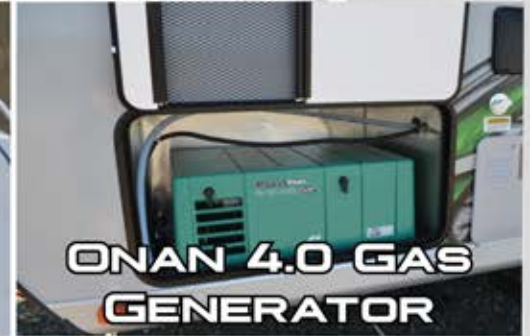
ONAN 4.0 GAS GENERATOR