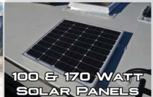
100 & 170 WATT SOLAR PANELS