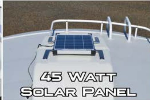
45 WATT SOLAR PANEL