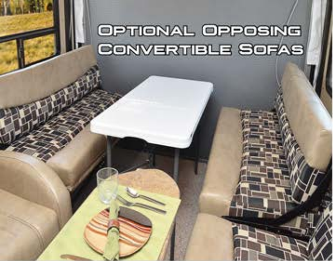
OPTIONAL OPPOSING CONVERTIBLE SOFAS