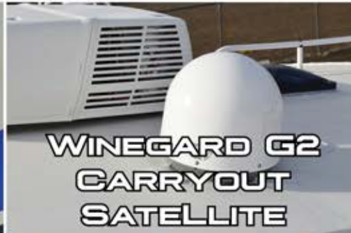
WINEGARD G2 CARRYOUT SATELLITE