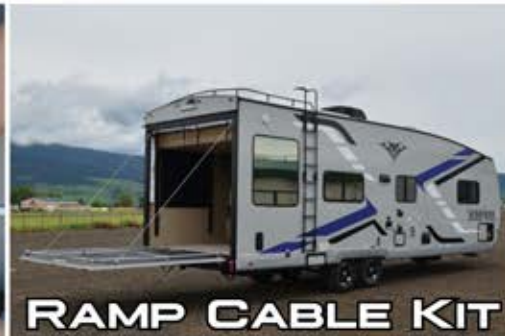
RAMP CABLE KIT