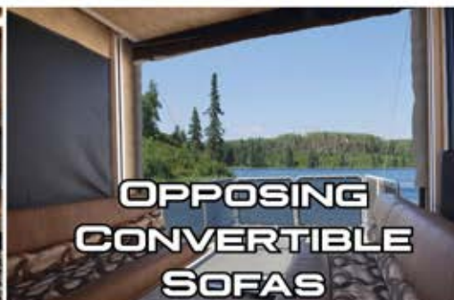
OPPOSING CONVERTIBLE SOFAS