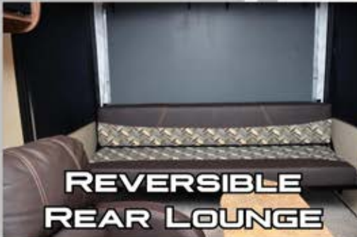
REVERSIBLE REAR LOUNGE