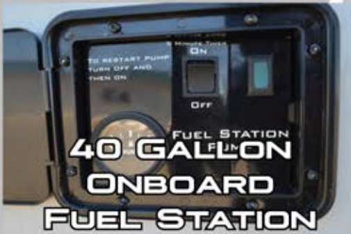
40 GALLON ONBOARD FUEL STATION