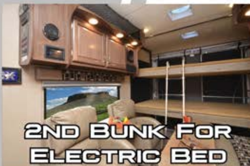
2ND BUNK FOR ELECTRIC BED