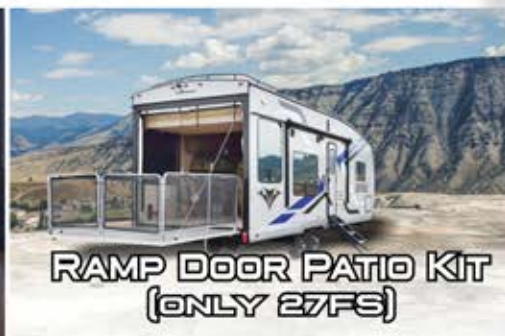
RAMP DOOR PATIO KIT (ONLY 27FS)