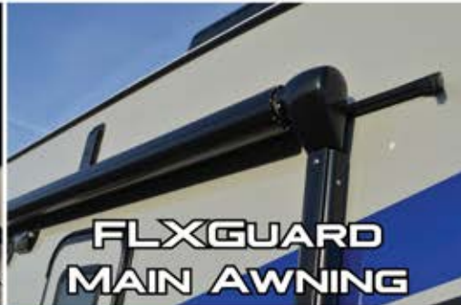
FLXGUARD MAIN AWNING