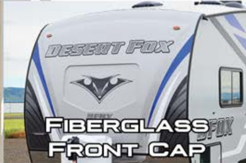
FIBERGLASS FRONT CAP