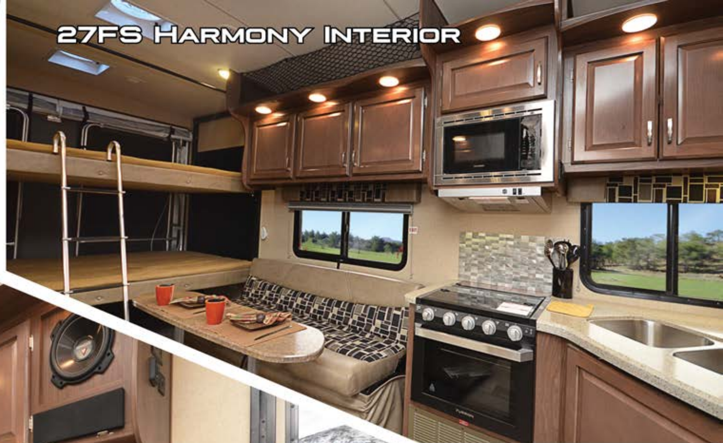
27FS HARMONY INTERIOR