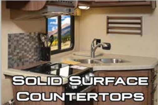
SOLID SURFACE COUNTERTOPS