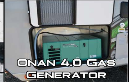
ONAN 4.0 GAS GENERATOR