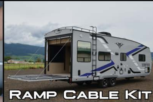
RAMP CABLE KIT