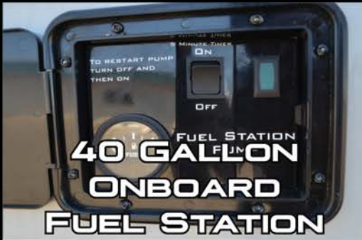
40 GALLON ONBOARD FUEL STATION