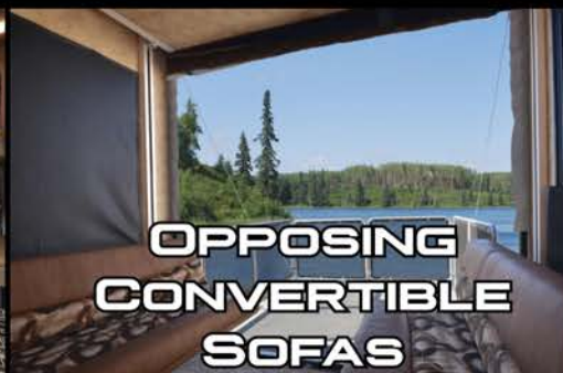
OPPOSING CONVERTIBLE SOFAS