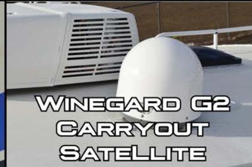
WINEGARD G2 CARRYOUT SATELLITE