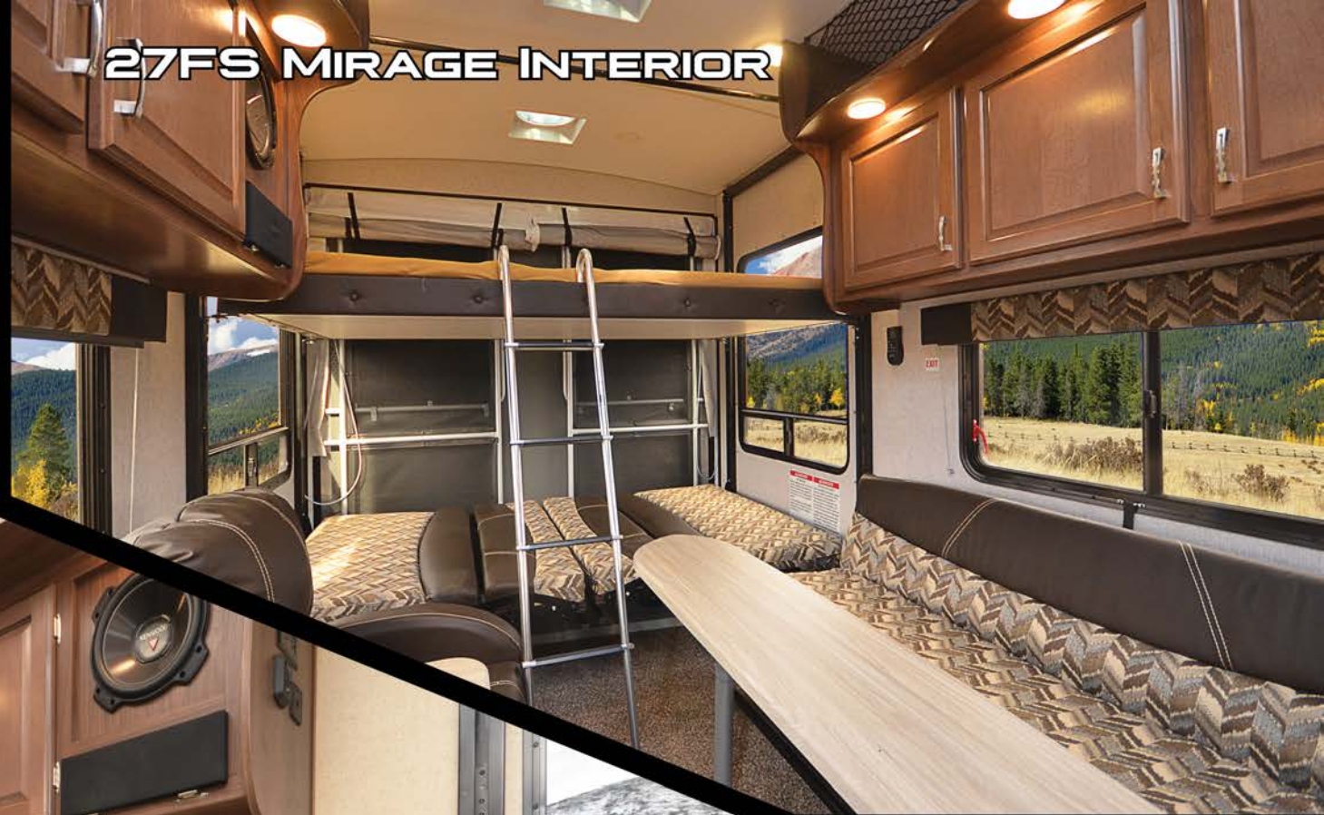
27FS MIRAGE INTERIOR