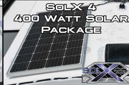
SOLX 4 400 WATT SOLAR PACKAGE