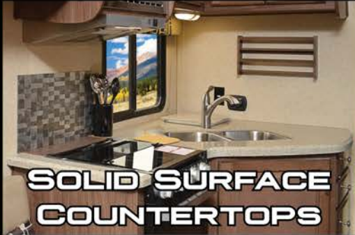
SOLID SURFACE COUNTERTOPS