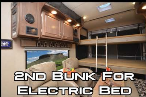
2ND BUNK FOR ELECTRIC BED