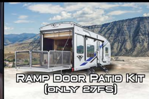
RAMP DOOR PATIO KIT (ONLY 27FS)