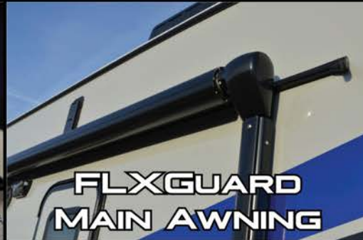
FLXGUARD MAIN AWNING