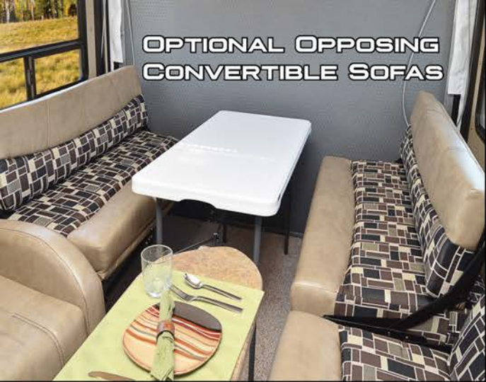
OPTIONAL OPPOSING CONVERTIBLE SOFAS