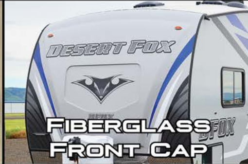
FIBERGLASS FRONT CAP