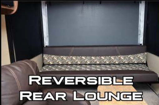
REVERSIBLE REAR LOUNGE