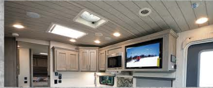
SHAKER PLANK-STYLE CEILING