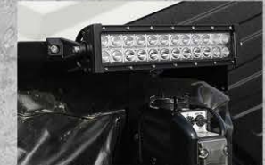
LED LIGHT BARS, FRONT & BACK