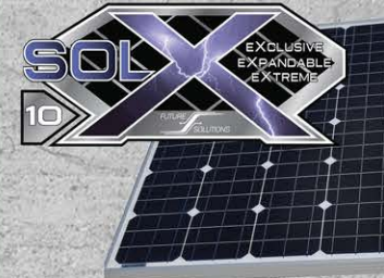
SOLX 10 SOLAR PANELS 1,000 WATTS OF SOLAR