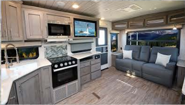
WILEY OAK WOODGRAIN FINISH