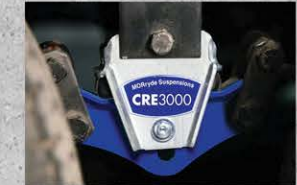
MORRYDE CRE-3000 SUSPENSION