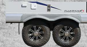
GOODYEAR WRANGLER DURA-TRAC, LIGHT TRUCK TIRES AND CUSTOM ALUMINUM WHEELS