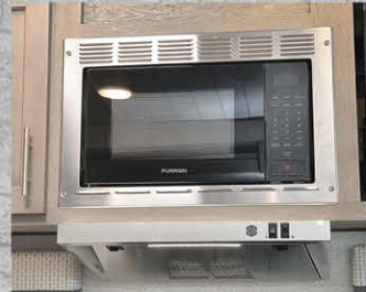
MICROWAVE WITH AIR FRYER