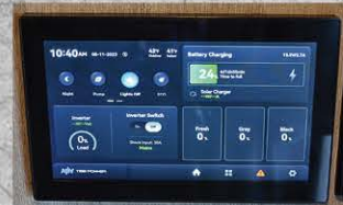
FOXFORWARD MULTI-PLEX SYSTEM