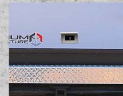
EBIKE CHARGING STATION