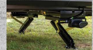
5 POINT LEVELING SYSTEM - HD