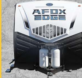
ALL NEW FULL-FIBERGLASS FRONT CAP WITH BACKROAD ARMOR