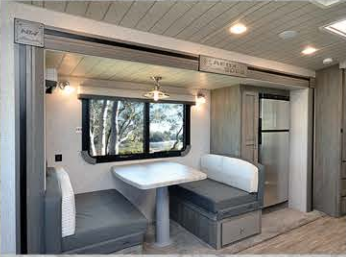
SLEEK SLIDE-OUT FASCIA WITH COORDINATING WINDOW TRIM