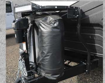
SAFARI TUFF LPG STORAGE RACK DUAL 10 GALLON LP TANKS