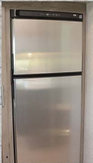
FURRION STAINLESS STEEL, 12V REFRIGERATOR-FREEZER