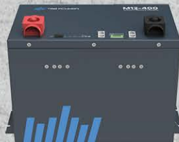
400AH LITHIUM BATTERY ONLY