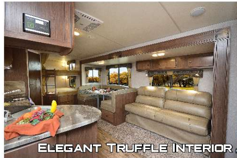
ELEGANT TRUFFLE INTERIOR