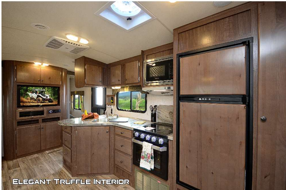
ELEGANT TRUFFLE INTERIOR