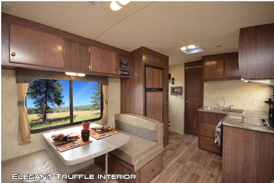
ELEGANT TRUFFLE INTERIOR