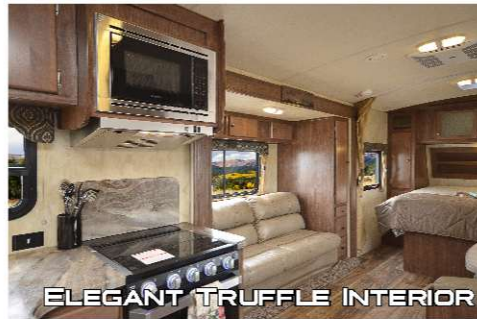
ELEGANT TRUFFLE INTERIOR