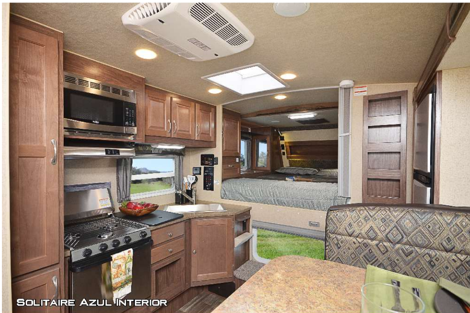
SOLITAIRE AZUL INTERIOR

Large Exterior Folding Grab Handle CSA (Canadian Dealers Only) 19" 12V LED TV 32" 12V LED TV (NA w/Larger Roadside Ward) Thermal-Pane Windows Arctic Fox Camper Seat-Step Fox Landing Pull Out Mid Step Addl. Fox Landing steps 2.5 Onan LP Generator 100 Watt Solar Panel 170 Watt Solar Panel Winegard Carryout G2+ Sat Dish (DISH/DIRECT) Larger Roadside Ward (NA w/32" 12V LED TV) Overhead Bunk In Dinette Swing Out Brackets 76" Roll-over Lounge Full Wall Ward Curb Side 3-Way 7 cu ft Dbl Door Refer 11K BTU Air Conditioner 3 Burner Cooktop (Del Oven) – No Charge Aussie Grill w/Bracket Coleman Mach 8 9K BTU A/C Convection Oven (Del Microwave) 2 Lg Drawers Under Cooktop 24" Add-A-Step 10' Side Box Awning Slide Out Topper Rear View Camera Gateway Router FOX VALUE PACKAGE