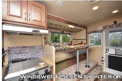
WINDSWEPT SERENITY INTERIOR