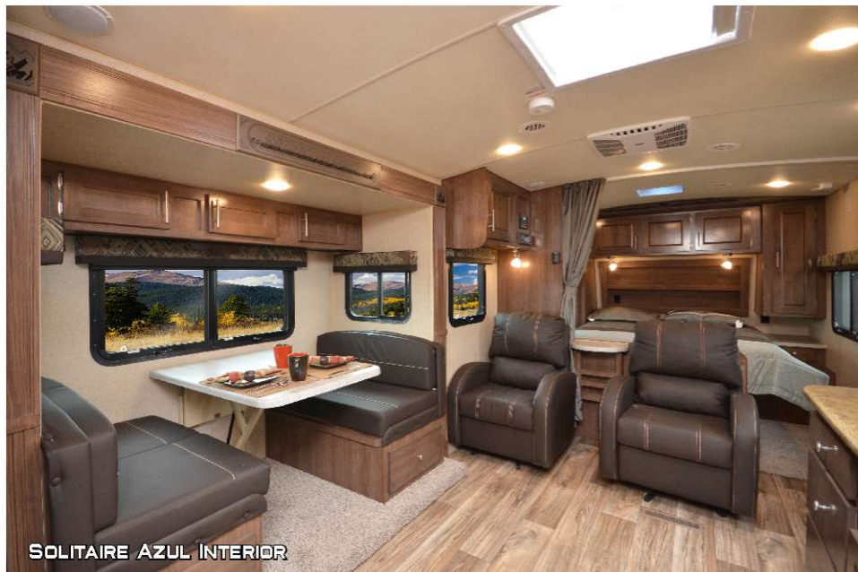
SOLAIRE AZUL INTERIOR