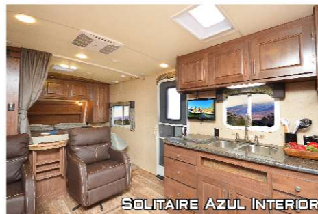
SOLAIRE AZUL INTERIOR