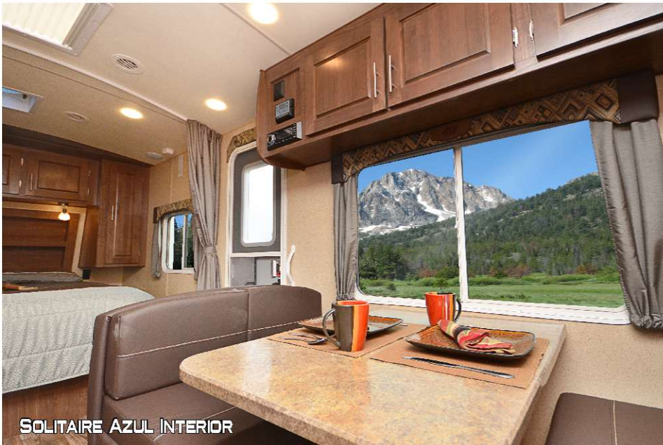
SOLITAIRE AZUL INTERIOR