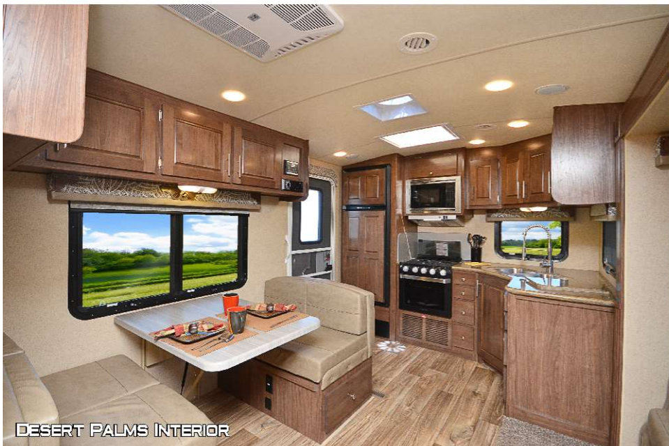
DESERT PALMS INTERIOR