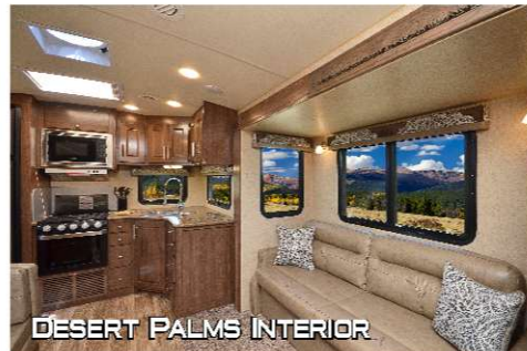
DESERT PALMS INTERIOR