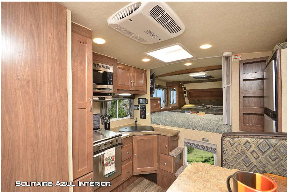
SOLITAIRE AZUL INTERIOR

CSA (Canadian Dealers Only) 19" 12V LED TV 32" 12V LED TV (NA w/Larger Roadside Ward) Thermal-Pane Windows Arctic Fox Camper Seat-Step Fox Landing Pull Out Mid Step Addl. Fox Landing steps Gen Ready (Short Box Only) 2.5 LP Onan Generator 100 Watt Solar Panel 170 Watt Solar Panel Winegard Carryout G2+ Sat Dish (DISH/DIRECT) Larger Roadside Ward (NA w/32" 12V LED TV) Overhead Bunk In Dinette Swing Out Brackets 69" Roll-over Lounge Full Wall Ward Curb Side 3-Way 7 cu ft Dbl Door Refer 11K BTU Air Conditioner 3 Burner Cooktop (Del Oven) – No Charge Aussie Grill w/Bracket Coleman Mach 8 9K BTU A/C Convection Oven (Del Microwave) 2 Lg Drawers Under Cooktop 24" Add-A-Step Side Box Awning-Road Side Slide Out Topper Side Boxes (Short Box Only) Rear View Camera Gateway Router FOX VALUE PACKAGE