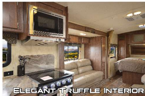
ELEGANT TRUFFLE INTERIOR