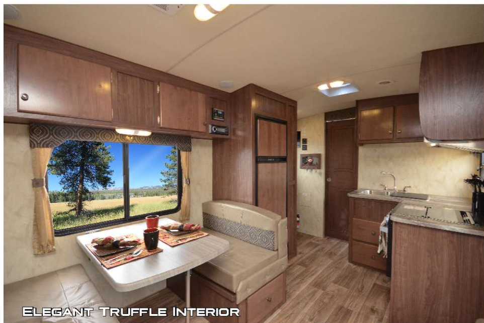
ELEGANT TRUFFLE INTERIOR

Slide Out Topper CSA (Canadian Dealers Only) 28" 12v LED TV 15K Air Conditioner w/ Ducting Fan Vent - Bedroom Fan Vent - Kitchen Fan Vent - Bathroom (Exhaust Only) Thermal Pane Windows ObeCo Convenience Center Sit & Sleep (Replaces NW TruRest Mattress) 3.6 Onan LP Generator 100 Watt Solar Panel 170 Watt Solar Panel Cargo Carrier Aussie Grill w/Bumper Bracket Gateway Router OTG Package