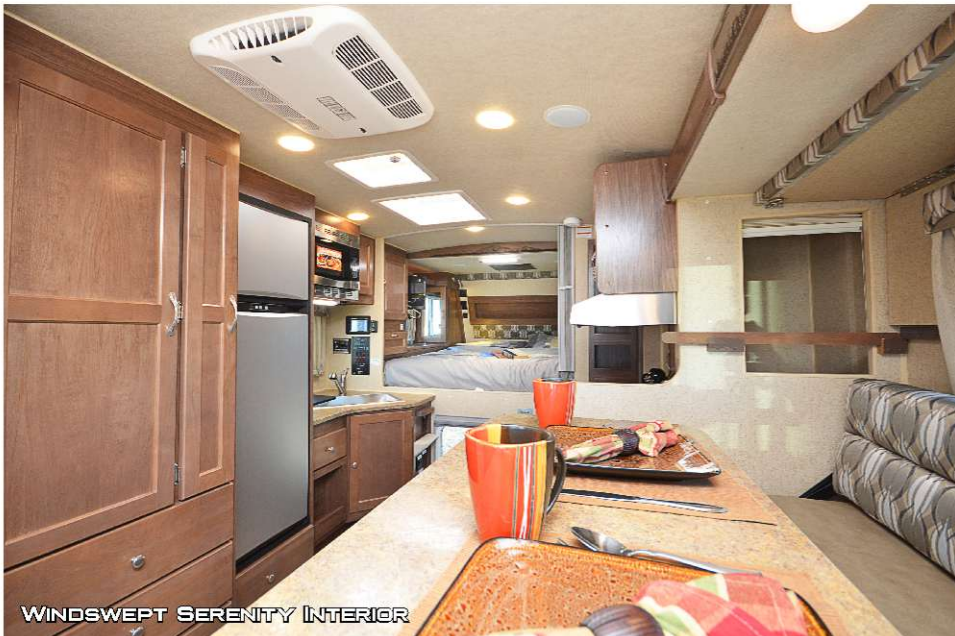
WINDSWEPT SERENITY INTERIOR

Large Exterior Folding Grab Handle CSA (Canadian Dealers Only) 19" 12V LED TV 32" 12V LED TV (NA w/Larger Roadside Ward) Thermal Pane Windows Arctic Fox Camper Seat-Step Fox Landing Pull Out Mid Step Addl. Fox Landing steps 2.5 Onan LP Generator 100 Watt Solar Panel 170 Watt Solar Panel Winegard Carryout G2+ Sat Dish (DISH/DIRECT) Larger Roadside Ward (NA w/32" 12V LED TV) Dry Bath - No Charge Wet Bath - No Charge Overhead Bunk In Dinette 76" Roll-over Lounge Full Wall Ward Curb Side 11K BTU Air Conditioner 3 Burner Cooktop (Del Oven) - No Charge Aussie Grill w/Bracket Coleman Mach 8 9K BTU A/C Convection Oven (Del Microwave) 1 Lg Drawer Under Cooktop 24" Add-a-Step 10' Side Box awning Slide Out Topper 3-Way 8 Cubic Foot Dbl Door Refer Rear View Camera Gateway Router FOX VALUE PACKAGE