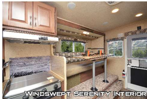
WINDSWEPT SERENITY INTERIOR

FOX VALUE PACK #505: (MANDATORY) Rear Electric Awning/Sliding Battery Rack Dual 30lb LP Tanks/ Roof Rack & Ladder Rico Titan Electric Jacks w-6 function remote/Outside Speakers / "Joey" Sliding Storage Tray/Omni-Directional TV Antenna Extender Ready / Diamond Plate Knee Wall Armor Large 2 Way Fridge (8Cu Ft) w/ Cold Weather Kit Deluxe Stainless-look Refrigerator Door Panels Large 22" Oven/Microwave Oven Multi-Speed Reversible Fan Vent Hardwood Hamper Doors Below Dinette Access Door & Drawer Front Bedroom Shelf/Bedspread